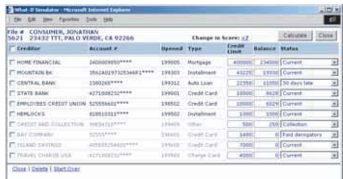
Figure 3: What-If Simulator